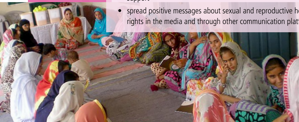
'Girls Power' tea party in Pakistan

With IPPF funding for youth-led projects, young volunteers for Rahnuma–Family Planning Association of Pakistan set up the 'Girls Power' project. They organized 144 tea parties that brought together over 2,500 girls and gave them a safe space to discuss issues such as contraception, sexually transmitted infections, human rights, abortion and gender-based violence. Following the project, a quarter of the girls accessed services from the Member Association and hundreds more young women gained information via confidential helplines and social media outreach.