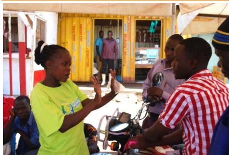
Demonstrating female condoms in Uganda.