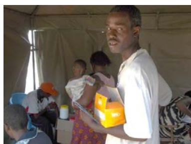
Community outreach in Kenya

India's estimated HIV prevalence remains concentrated among key population groups, with the highest HIV prevalence among transgender women. In 2012, the HIV prevalence among transgender women in major cities like Mumbai and Delhi was nearly 25%. Vulnerability to HIV is often due to poverty, lack of family support, and absence of legal recognition and the ability to function productively in society. In 2009, the Delhi High Court decriminalised homosexual relations, but in December 2013, the Supreme Court overturned this decision and reinstated section 377 of the Indian Penal Code, which criminalises sexual activities 'against the order of nature'. This impacts on the considerable stigma and discrimination that prevails against MSM and transgender people, especially transgender women and the Hijra community. This stigma and discrimination, which is embedded in Indian society, plays out in health care settings. It leads to poor access for transgender people to services, further